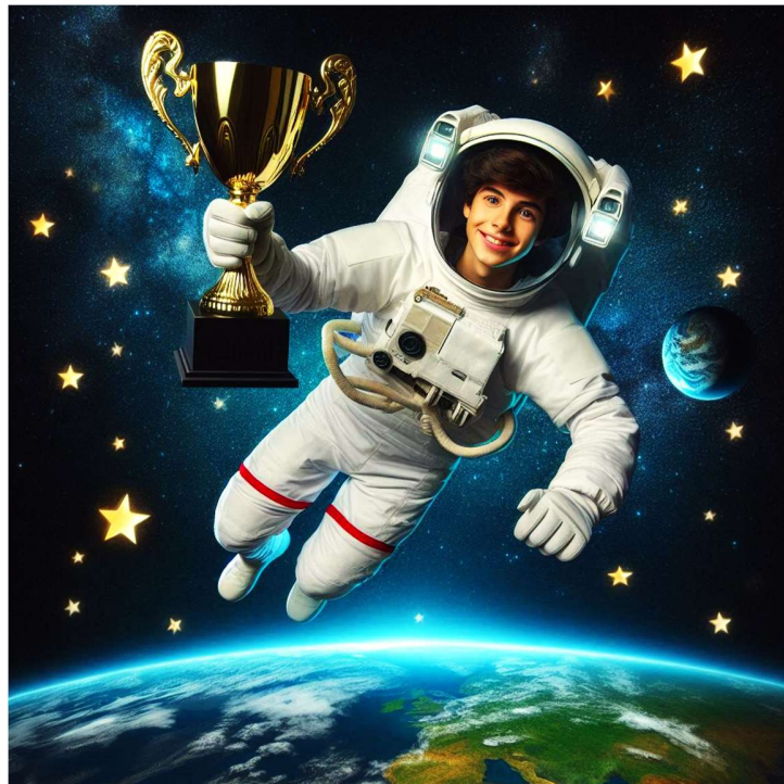
Figure 1: Example of a figure.